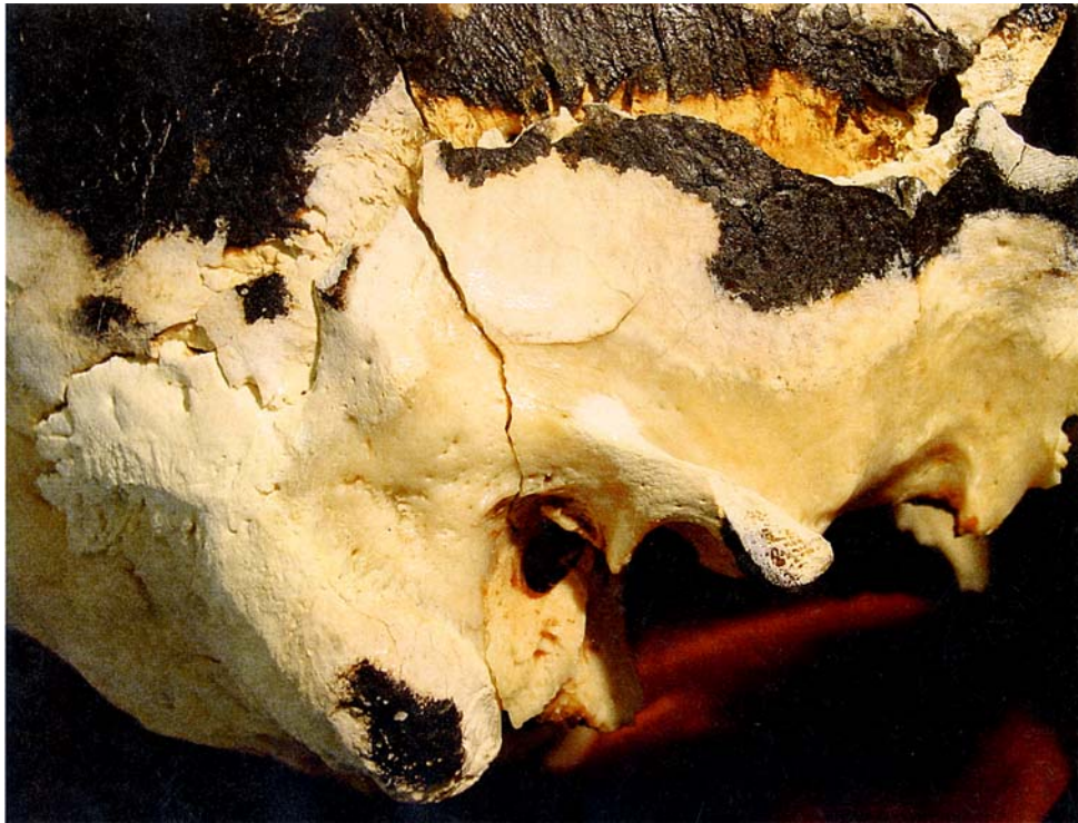
FIG. 3—Only traumatic preexisting fractures radiate into unburned bone.