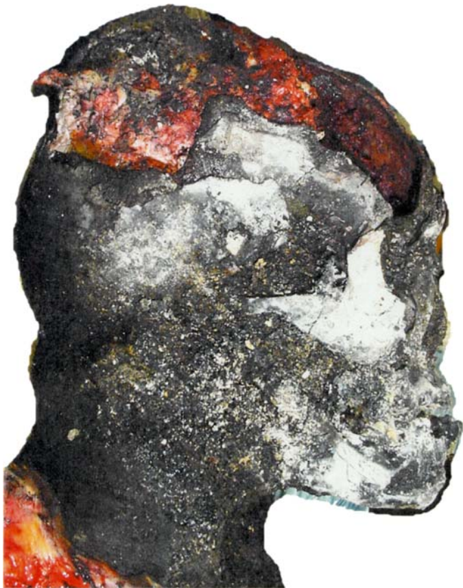
FIG. 5—The “exploded appearance” of the skull.

Another association with non-traumatized heads is a belief that burning skulls will explode into small fragments if preexisting openings from ballistic or blunt force injuries are not present to relieve steam pressures from the heated brain (Fig. 5). Rationalization of this theory compares the undamaged head to an egg or potato exploding if heated without punctures for the release of steam. Conversely, the presence of preexisting trauma allegedly helps maintain structural integrity and does not explode since steam should escape through traumatic defects or fractures. These dichotomous appearances of the skull are purportedly important diagnostic indicators of preexistent trauma in the post-fire condition. This dangerous assumption potentially discourages further investigation if one accepts the fragmented or “exploded-looking” skull as proof for the absence of preexisting trauma. Such oversight dismisses the impor-