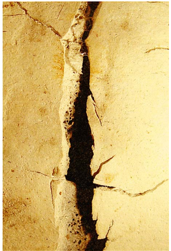
FIG. 4—(left) Heat-related fractures have well-defined sharp corresponding margins. (right) Preexisting traumatic fractures have eroded, blunted, and deformed margins from prolonged thermal exposure.