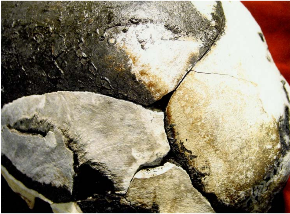
FIG. 7—Venting organic material permanently impregnates preexisting traumatic fractures and openings in cranial bone.